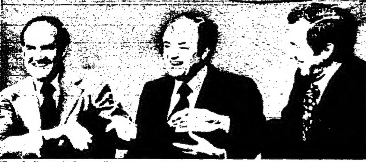
Three leading contenders for the Democratic nomination prepare for appearance on television Sunday night. Left to right: George McGovern, Hubert Humphrey and Edmund Muskie.

NEW DELHI (AP). — Elephants have killed at least 24 persons in five villages around Chandika Forest, 1,255 km. southeast of New Delhi, the United News of India reported yesterday.